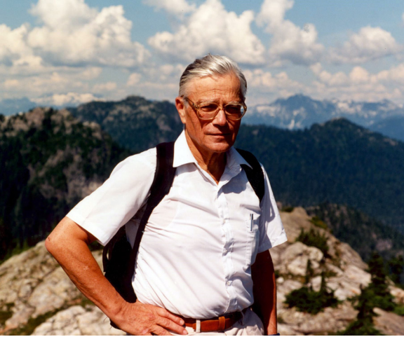
Borel on Mount Speer, 1983.